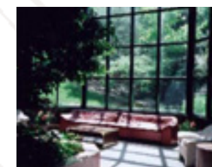
1200 Don Mills before...

Solution: Replace the oversized tree with a bronze sculpture garden, creating a sitting area for conversation – allowing viewing the gardens as well as the mezzanine level. Several furniture vignettes provide additional seating. Accessorizing completes the finished look. A traditional approach with transitional elements – a trusted look.